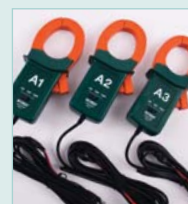
Model PQ34-12 1200A Current Clamp Probes with 2" (50mm) jaw opening