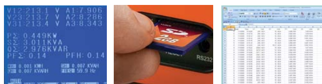
Backlit LCD displays numerical values. The data can be stored in SD memory card (included) and then transferred from meter to PC using Excel ® software and datalogged readings.

Complete with 4 voltage leads with alligator clips, 8 AA batteries, SD memory card, Universal AC adaptor (100 to 240V), and case. Clamp probes sold separately.