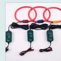
Model PQ34-30 3000A (24"/600mm) Flexible Current Clamp Probes for wrapping around busbars

Contact: Industrial Process Measurement, Inc. 3910 Park Avenue, Unit 7 Edison, NJ 08820 732-632-6400 support@instrumentation2000.com http://www.instrumentation2000.com