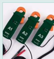
Model PQ34-2 200A Current Clamp Probes with 0.8" (19mm) jaw opening

Choose the best clamp probes to fit your application needs ranging from 200A to 3000A and flexible vs traditional jaw type.