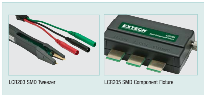
LCR203 SMD Tweezer