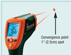
Two laser points converge at a distance of 50"/(127cm) and form a 1" (2.5cm) spot.