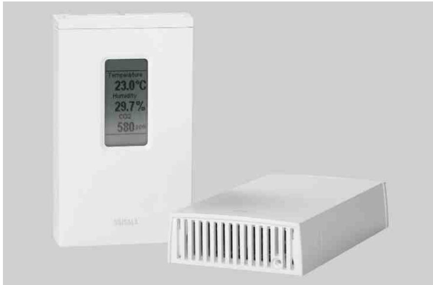
GMW90 Series Carbon Dioxide, Temperature and Humidity Transmitters for HVAC are available with either a display opening or a solid front.

The Vaisala GMW90 Series CARBOCAP ® Carbon Dioxide, Temperature, and Humidity Transmitters are based on new measurement technology for even more reliable and stable readings yet than used to. These wall-mounted transmitters are easy to install and have very low maintenance requirements.