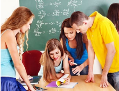
Indoor air quality