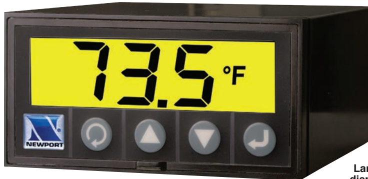
Large digital display mode.

NEWPORT's new 1/8 DIN DPi1701 Series graphic display panel meter and data logger provides unmatched display functionality and performance. The high intensity, backlit, graphic display (240 x 64 dots) provides powerful display features such as horizontal bar graph, line graph, and data logging in real time. The unit can be configured to accept Thermocouples (J, K, T, E, R, S), RTDs (2- or 3-wire), Voltage (0 to 10 Vdc), or Current (0 to 20 mA). Optional features are two Form C relays, isolated USB or RS232 PC interface, isolated analog output, isolated 24 Vdc excitation, and wireless receiver.