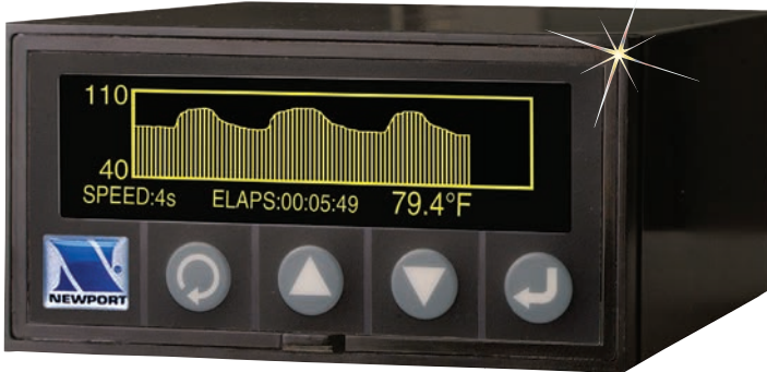
Graphic panel meter shown in line graph charting mode.

With Optional Alarm Relays, Isolated Analog Output, 24 Vdc Excitation Voltage, and Wireless Receiver