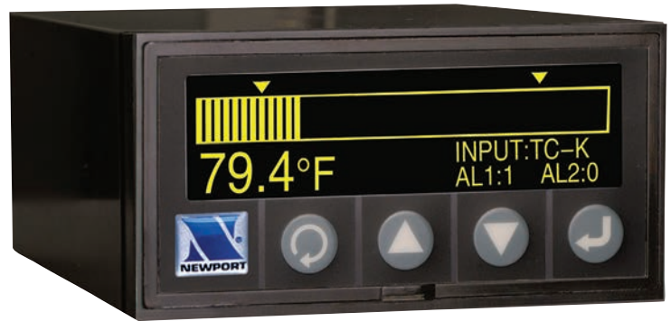
Horizontal bar graph mode.

All models shown smaller than actual size.