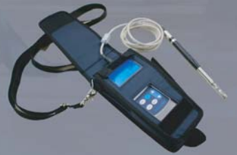
Hands-free Case now available!