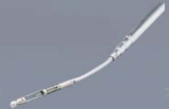
Telescopic, articulating probe