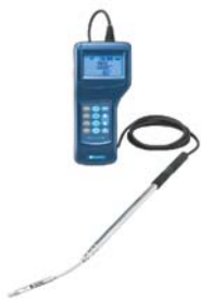
Anemomaster Professional Model 6036

Thermal Anemomaster Professional, model 6036 for face velocity measurement. Data stored in the unit can be downloaded to PC.