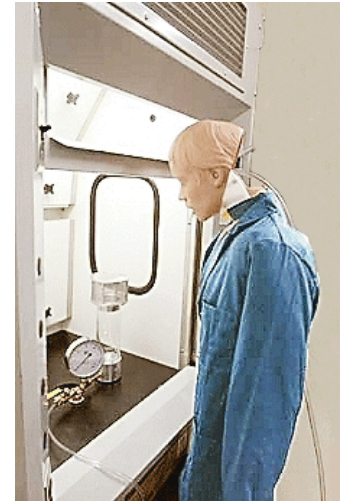
ASHRAE 110 - 1995 Performance Testing