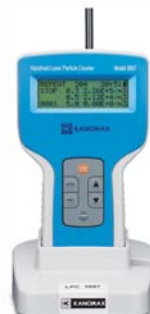
Model 3887 with Desktop Stand