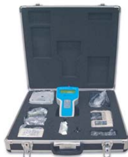
Carrying Case Makes Transportation Easy

Specifications are subject to change without notice.