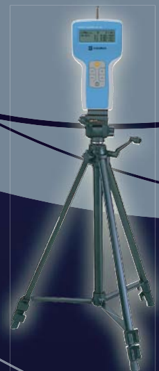
Tripod Mount Available