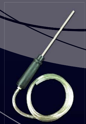
Extension probe is useful for hard-to-reach sampling points