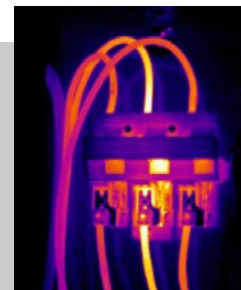
Three-phase Full Infrared