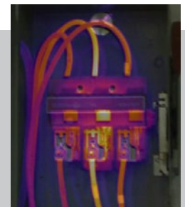
Three-phase AutoBlend Mode