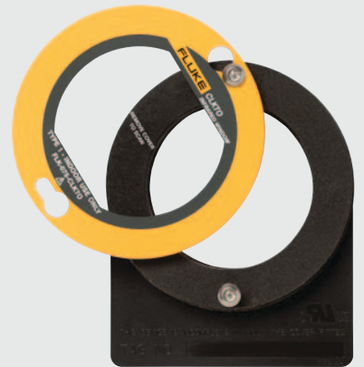
Fluke CLKTO IR Window for indoor medium voltage applications up to 38 kV