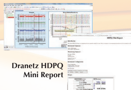
Dranetz HDPQ Mini Report