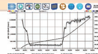
Demand & Energy Trend